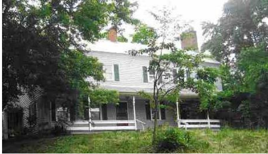
Figure 1: "Shippen" house