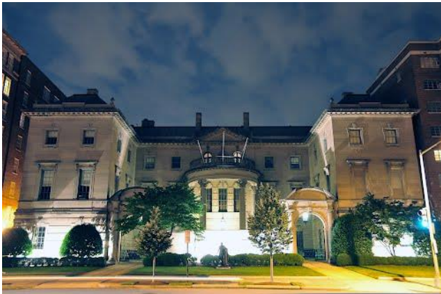
Anderson house: the Society of the Cincinnati Headquarters in Washington, D.C.