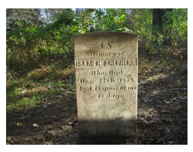
Figure 3: Isaac Shepard

http://goodspeedhistories.com/andrew-bray-and-sarah-rittenhouse/